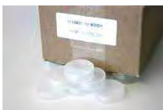
111 0601 ePW sample dishes