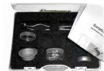
111 9979 SI Set Master