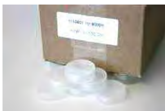
111 0601 ePW sample dishes