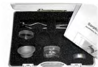
111 9979 SI Set Master