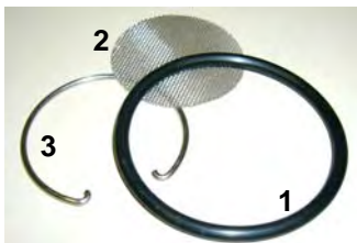
112 0174 O-Ring : 1 112 0175 Metal mesh filter: 2 260 0210 Tension ring : 3