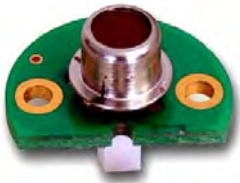
111 9983 CM-2 measuring cell