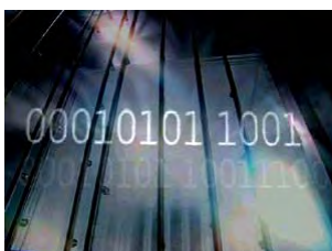
111 9976 License