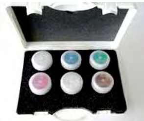
252 5418 Case with 6 Stk SAL-T for LabMaster and LabPartner-aw

The precision corresponds to eg. the Greenspan Report 1977 typically +/- 0.3 % rh Weight: 50 g