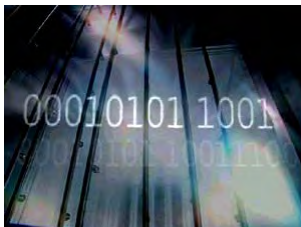
111 9975 License