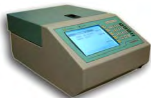
111 9971 LabMASTER-aw "BASIC"