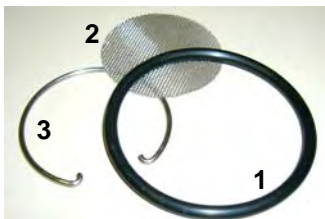
112 0174 O-Ring : 1 112 0175 Metal mesh filter: 2 260 0210 Tension ring : 3