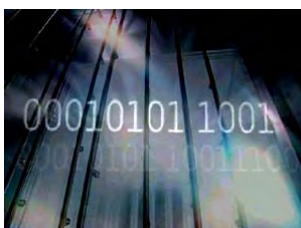
112 0171 License