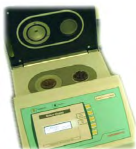
111 9974 LabPARTNER-aw

- certificate of the 6 point factory calibration 11-33-58-75-84-97%. Weight: 9.800 kgs Ground surface: 26 x 44 cm (WxL)