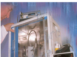
Prices see on the pricelist

All Novasina humidity standards are also available with an internationally recognised certificate from an accredited European laboratory (UKAS England) Weight: 50g